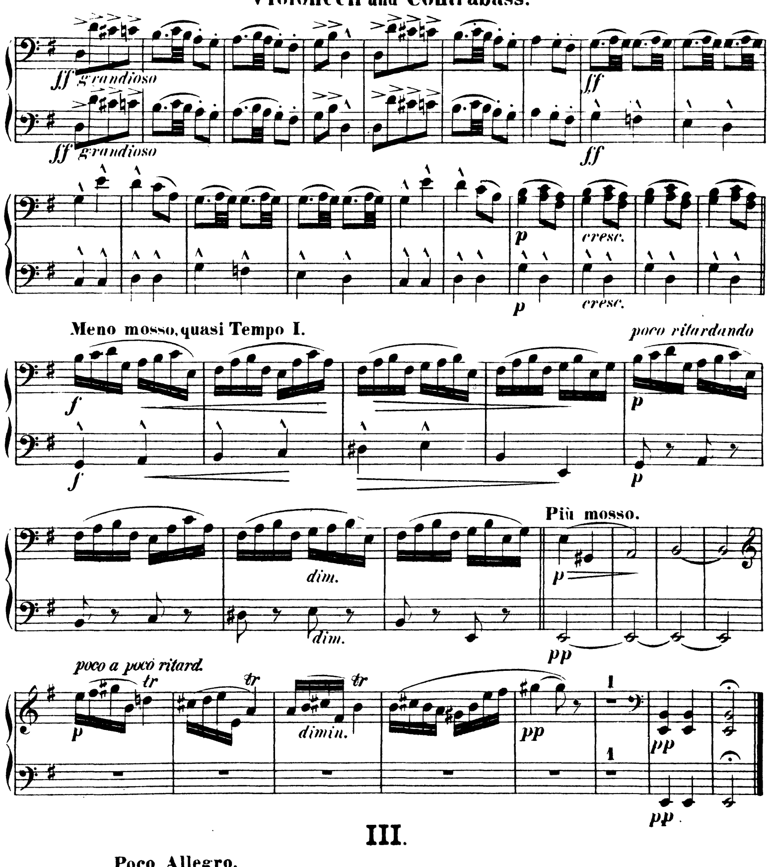
Poco Allegro. Violoncell I.II.